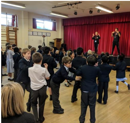
Love Theatre Arts assembly