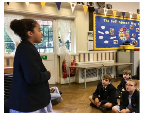
Black History Month assembly