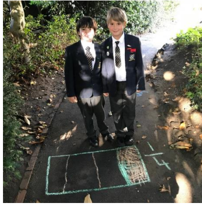
Y4 visual fractions learning