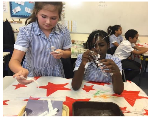
Y6's Giacometti inspired sculptures