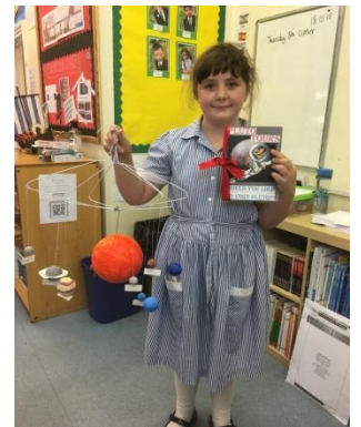
Y5 planet presentation