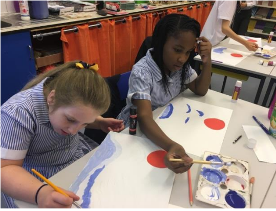
Y5 recreating Hokusai's Wave painting after reading about the artist in Kensuke's Kingdom