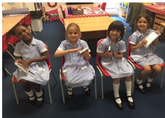
Y1 made their own musical instruments