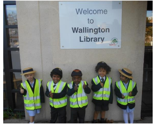
Kindergarten's library trip