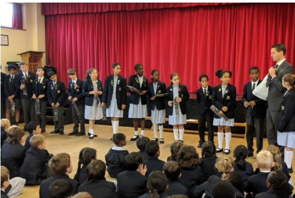
Y6 receive their prefect ties